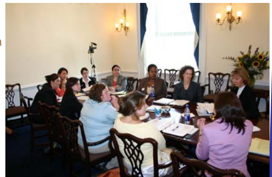
YWTF Chapter Directors meet with women members of Congress

On July 15, nine YWTF Chapter Directors did indeed make history as they gathered in Washington for the YWTF Chapter Director Retreat. The retreat began with a welcome reception hosted by YWTF's DC Metro Chapter, followed by two days of strategic planning during which Directors finalized YWTF's mission, vision, goals and structure (see page 2). The third day was packed with trainings in grassroots organizing, fundraising, and lobbying. During the final day, YWTF Directors lobbied their members of Congress on issues of concern to younger women. The retreat ended with a bang when six members of Congress sat around a table with YWTF Directors for over an hour! During this intimate "Congressional Dialogue," members engaged us in discussion about a variety of younger women's issues. To read more about the Congressional Dialogue, see page 2.