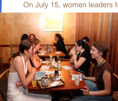
YWTF chapter directors network with YWTF DC chapter members

What do you get when you mix YWTF leaders, the DC chapter and salt rimmed glasses? "Feminist Margaritas on the Rocks"!